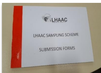
LHAAC Submission Form Booklet

It is probably not worth smaller LGAs, or LGAs who do a minimal amount of sampling, having a Submission Book. Those LGAs can continue to use